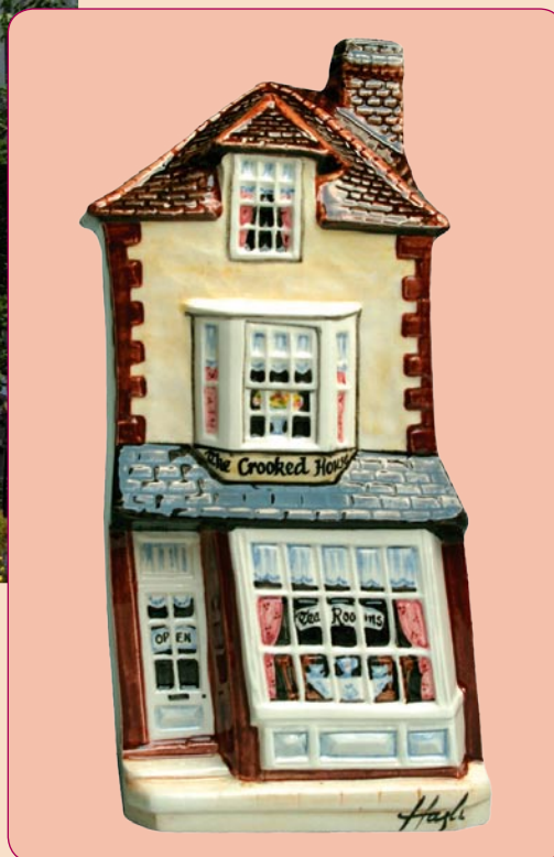
RIGHT: Hazle's Crooked House